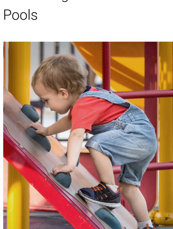
Outdoor Children's Play Areas