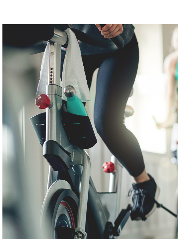
Fully Equipped Gym