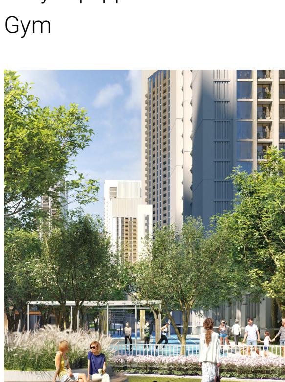
BBQ Pits & Landscaped Lawn Areas