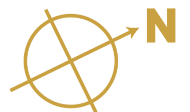
FLOOR PLAN - 13 th Floor